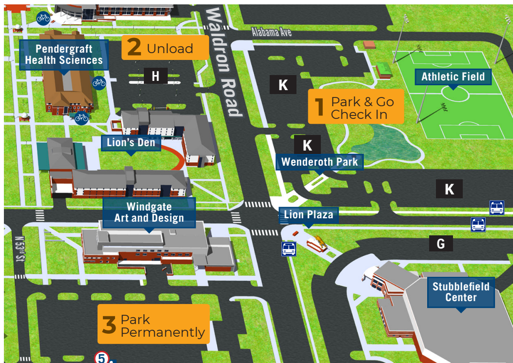
Map A: Lion's Den and surrounding areas